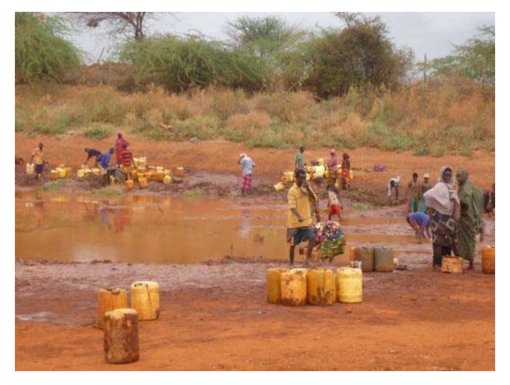
Figure 3. Marginalization in the northeast

An extreme example of the lack of services was seen in Tarbaj, north of Wajir. The only water source there is a water pan that, at the time of the ICTJ visit, was a pool of mud into which people dug to collect the dirty water that accumulated there (see Figure 3). The only alternative was to pay hundreds of shillings for a jerry can of water trucked from Wajir.