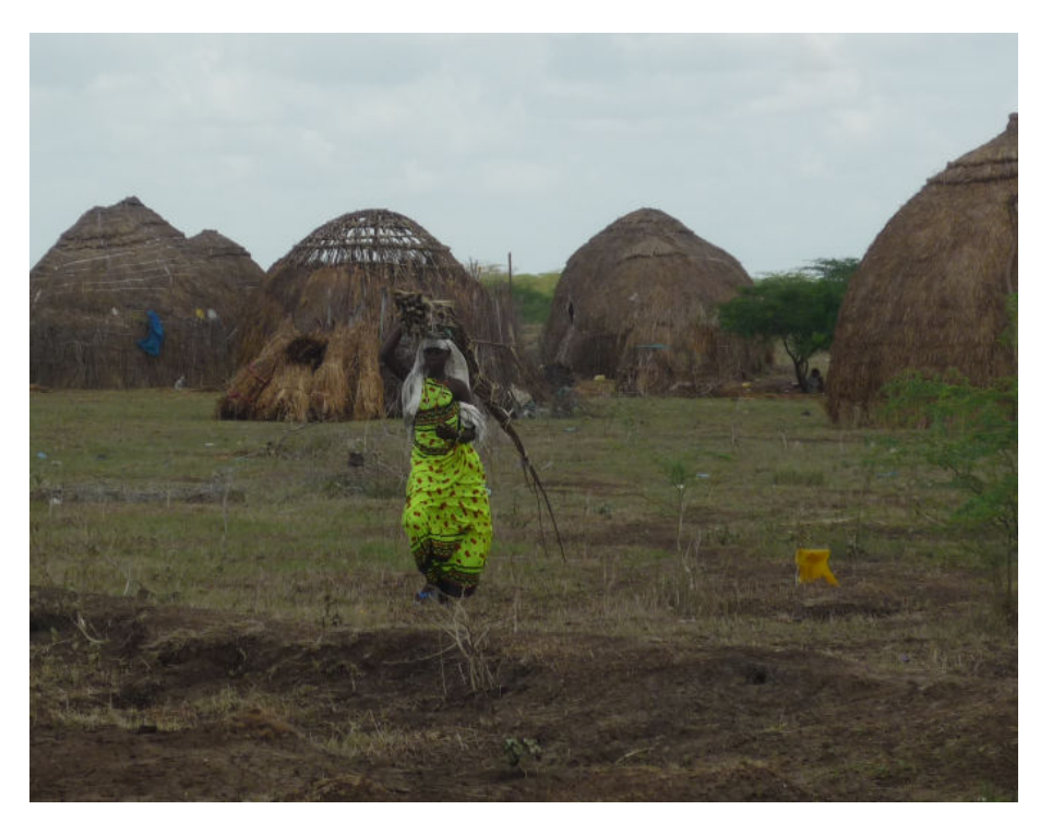
Figure 4. Preparation for eviction, Tarda community of the Tana River

Nearly all land in the Tana River and Tana Delta districts is trust land, and an overwhelming majority of the occupants do not have title deeds to their ancestral lands. They are considered squatters by the authorities, although they may have lived in the same place for generations.<sup>35</sup>